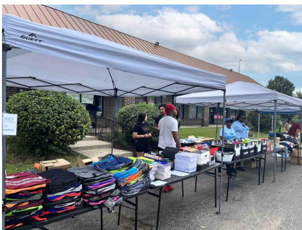
Volunteers from LAFCU, The Village Lansing, and the Capital Area District Library organize supplies before nearly 400 attendees arrive for the second annual Back-to-School Extravaganza giveaway event held at The Village Lansing.