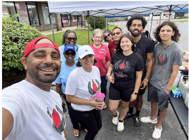
Among those who helped distribute donated school supplies and essentials were staff from The Village Lansing, LAFCU, Capital Area District Library, and local high school students.